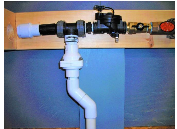
Install Suction Pipe