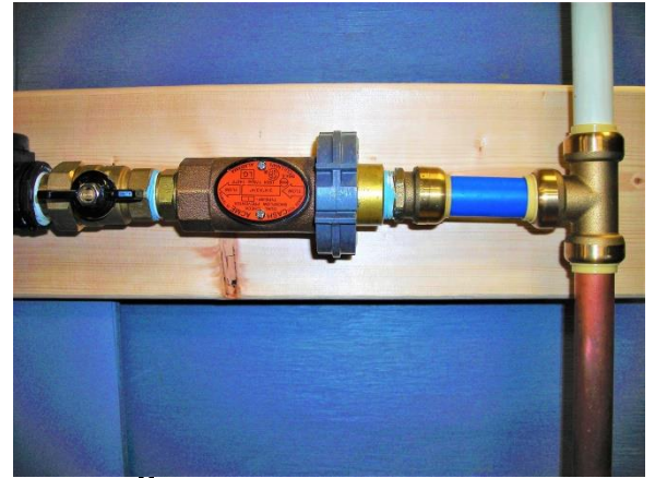
Connect Water Line