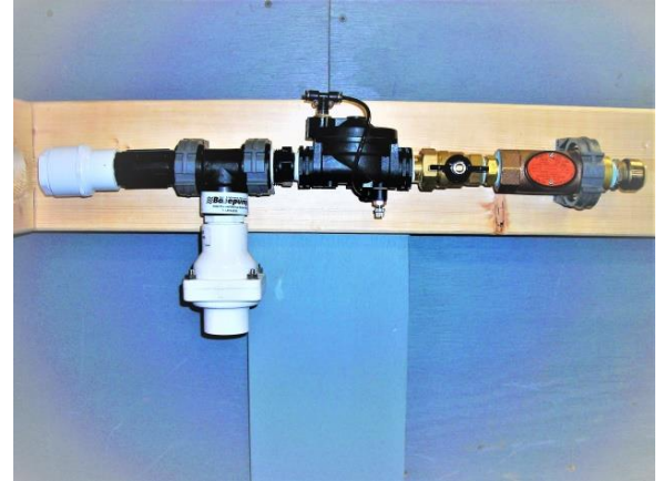
Mount Basepump Ejector