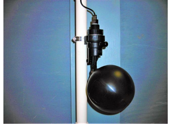
Mount the Float Valve